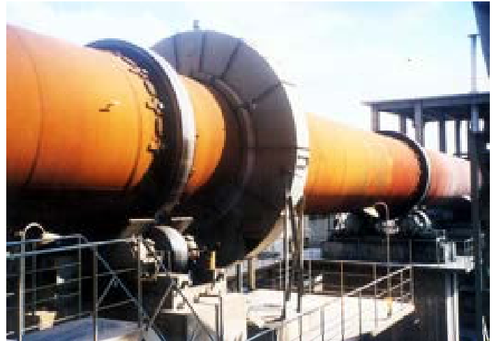
Open gearing, such as this huge ring gear that drives this rotary cement kiln, pose special lubrication challenges ... SWEPCO 164 solves them.

SWEPCO 164 Ultra EP Open Gear Lube has been specifically formulated to meet the unique challenges of lubricating a wide range of exposed gears, including swing gears on cranes, ring gears on rotary kilns, gearing on draglines and in quarries, foundries and many other operations.