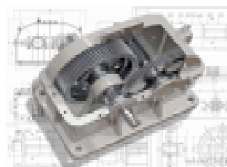
Extreme pressure applications

Enjoy better performance, longer drains and maximum gearbox life with SWEPCO 202.