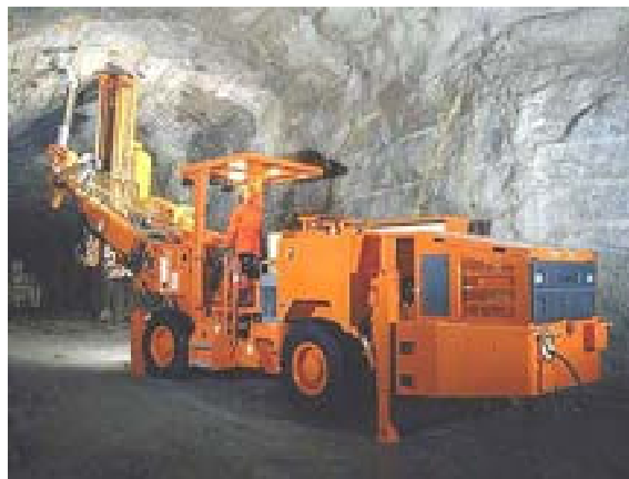
Many industries, such as underground mining, need high performance hydraulic oils which are also fire resistant. SWEPCO 770 Fire Resistant Hydraulic Fluid is the perfect answer.

SWEPCO 770 is compatible with most mineral oil, ester, and polyol ester based fluids.