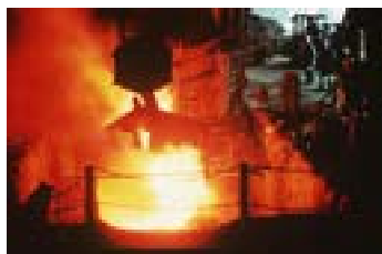
Foundries & Smelters